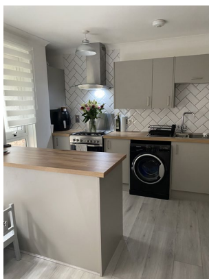
Barnsbury Mews improvements: pictured left, a downstairs WC has been transformed into a stylish utility room and, on the right, we have just been sent this photo of a fabulous new kitchen.