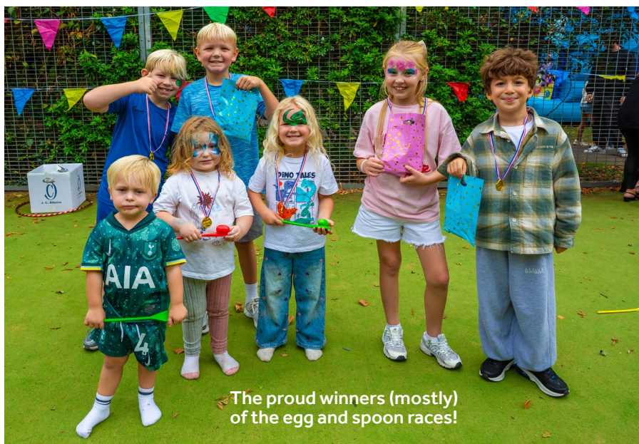
The proud winners (mostly) of the egg and spoon races!