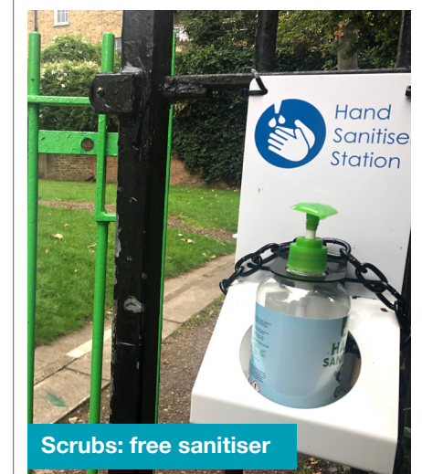
Scrubs: free sanitiser

Sporty youngsters are again using the playing court on the Morland Mews top site, but under strict instructions to follow our new Covid-19 safety protocols.