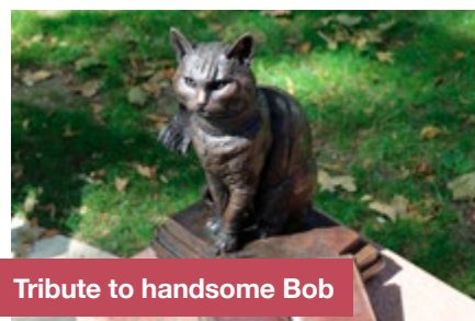
Tribute to handsome Bob