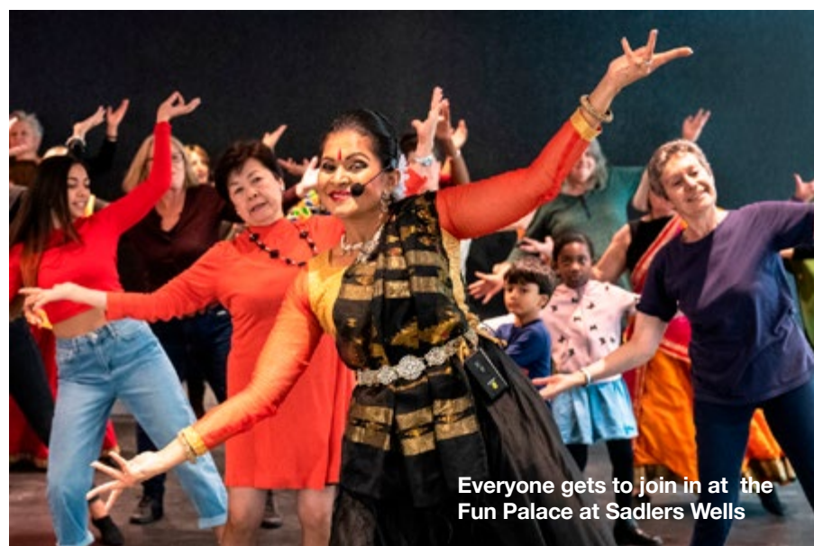
Everyone gets to join in at the Fun Palace at Sadlers Wells

Get into Dance 'cut-price tickets' at Sadlers Wells Theatre are back, with audiences running at full capacity. If you are already a member just book direct from the ticket office. Tickets cost £3 each. As members you can book up to four for each performance, buying up to 16 tickets in any one year.