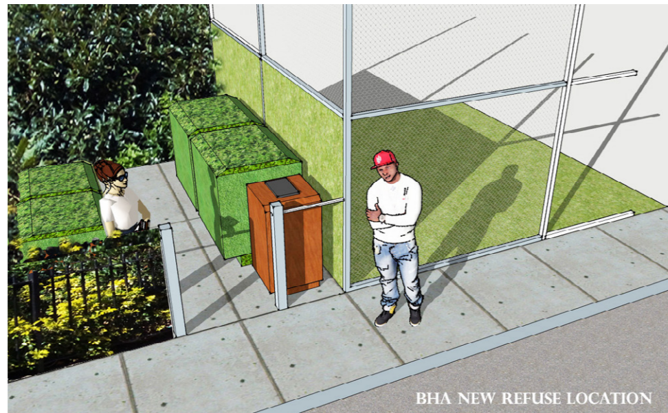
Above: a mock-up by your tenants' and residents' association of how the new recycling area might look